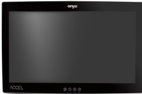
Power on / off LCD Brightness Touch Screen on/off