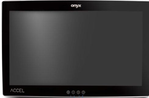
Power on / off LCD Brightness Touch Screen on/off