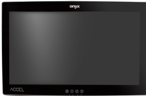
Power on / off LCD Brightness Touch Screen on/off