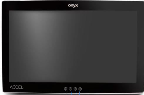
Power on / off LCD Brightness Touch Screen on/off